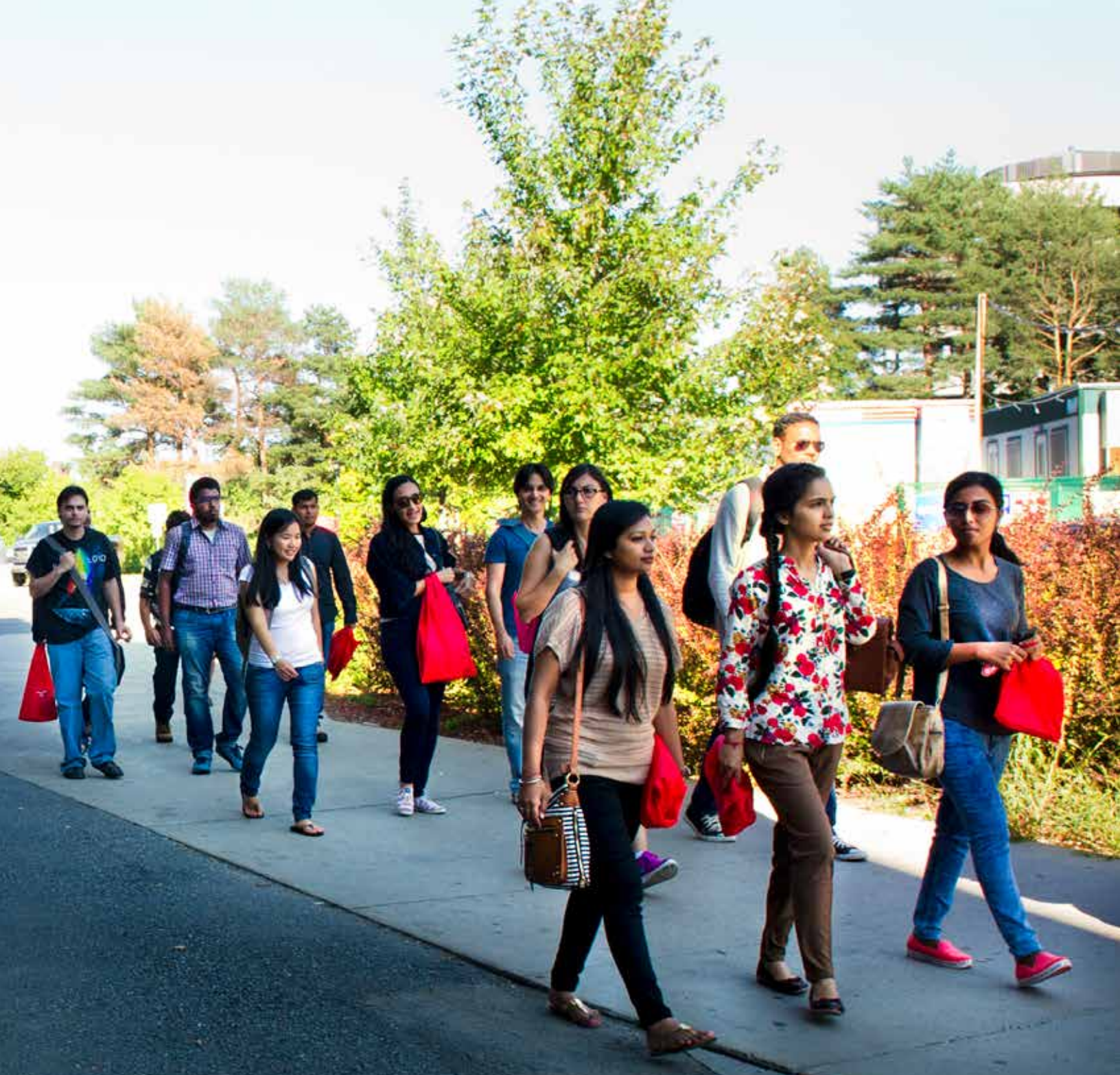
International graduate students tour the Carleton campus during fall Orientation.