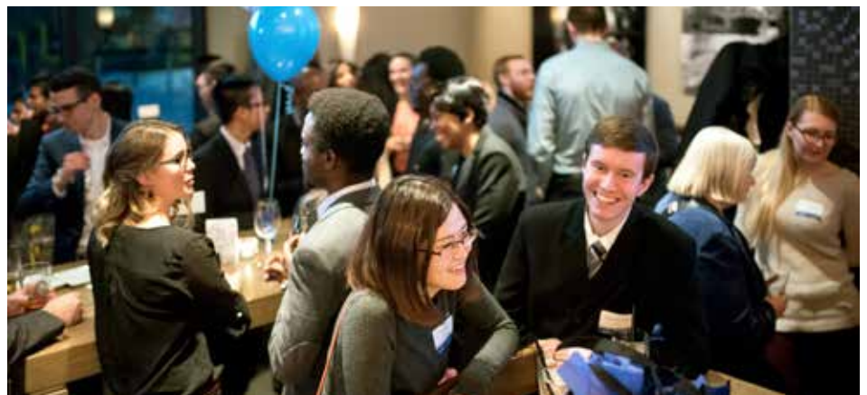
Sprott MBA alumni networking event

*within 1 year of graduation (Based on a survey of 2016 graduates)