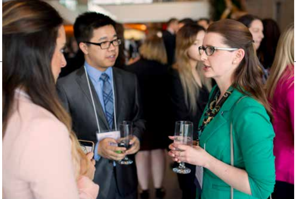
Annual MAcc & Cheese employer networking event

Complete applications received by May 31 will be assessed by mid-June. Applications can be submitted after May 31 until August 15, however they will be assessed only if space remains in the program.